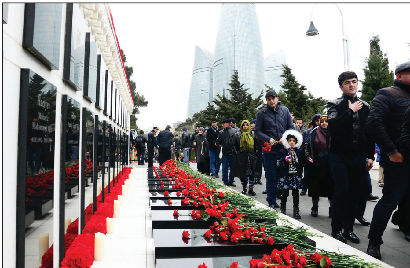
Azerbaijani people paid tribute to the victims of the bloody January 20 tragedy.

are still alive in the form and shape of Azerbaijan's irrevocable independence, uncompromising sovereignty and sustained socio-economic prosperity and the last but not the least, unbending national pride.