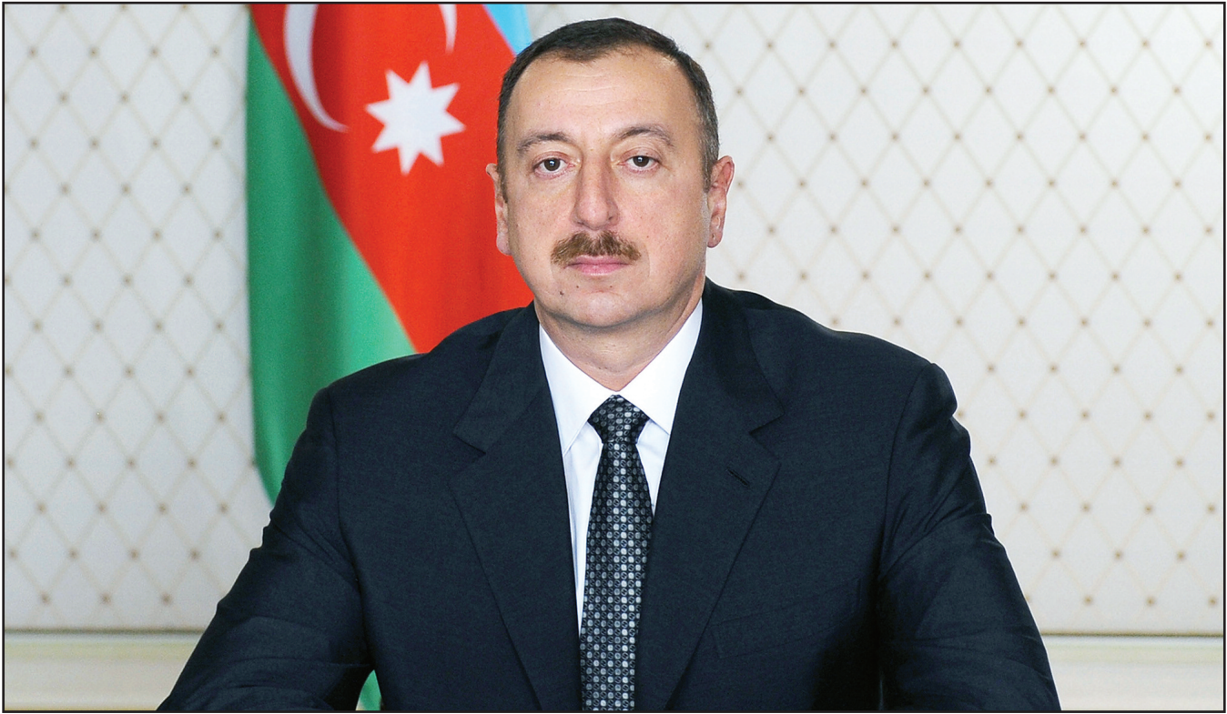
President of the Republic of Azerbaijan, Ilham Heydar Aliyev.

Human civilization has been worshipping people's resistance against cruelty, repression, abuse of authority, tyranny and military aggression since its inception. Subsequently, people who fought for independence, self-reliance, liberty, freedom, human rights and social justice became larger than life characters. People's resistance